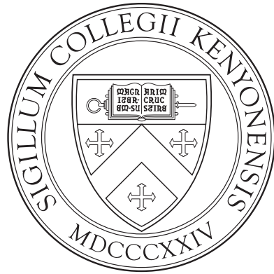
Black and White