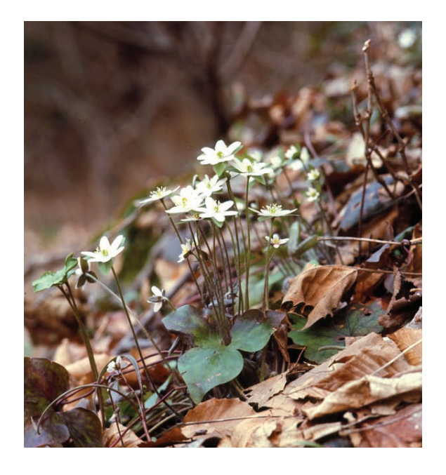
Spring emphemerals blooming in April include the bloodroot (top), yellow trout lily (middle) and hepatica (bottom).

the root was made into a tea to treat rheumatism and a drop of the sap would be mixed with sugar to treat coughs. The rhizome could be dried and was sometimes sold as a stimulant or as a remedy for rattlesnake bites. Today, we've learned that there are many potentially dangerous side effects of these uses. While the U.S. Food and Drug Administration has approved the use of sanguinarine in toothpaste, there is some evidence that suggests it may cause cancer. Sheesh! Perhaps we should just admire these ethereal blossoms while they're blooming in the forest.