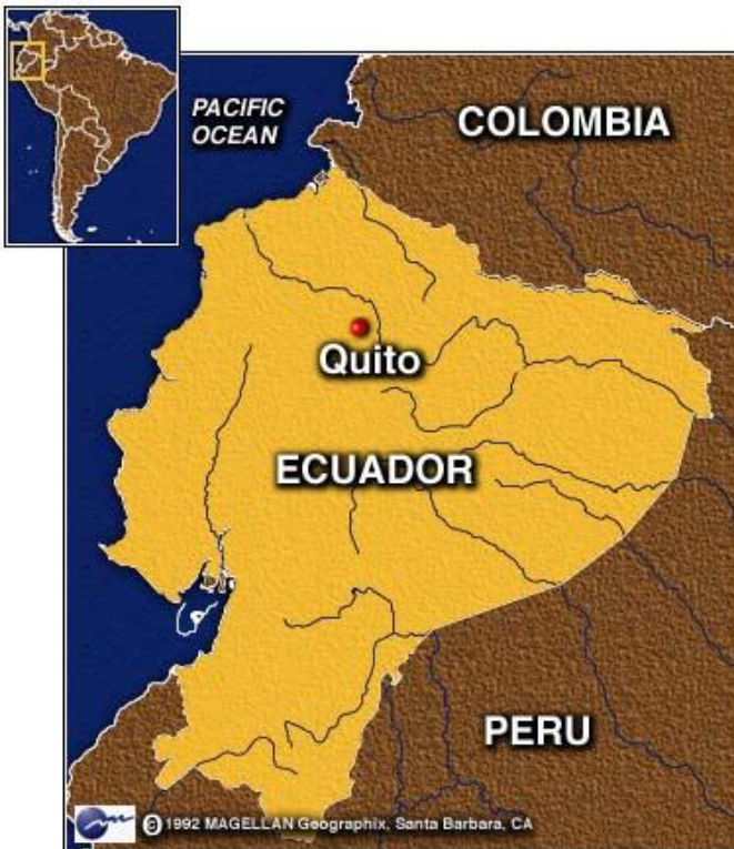
Fig. 2 Map of Ecuador