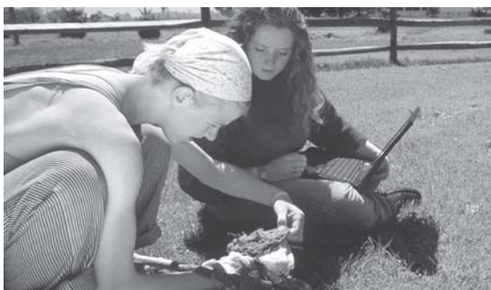
Students at the Brown Family Environmental Center