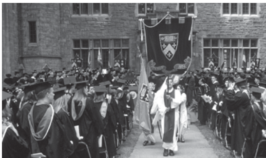
The pomp and circumstance of a Kenyon Commencement