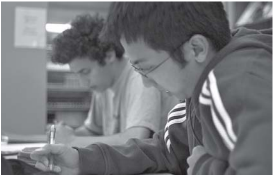
Students in Olin Library

More than 95 percent of Kenyon students bring a computer to campus, with the vast majority bringing laptops. Wireless access is available in all campus facilities as well as many outdoor areas; wired access is also available in most student residences. Students automatically receive a Kenyon e-mail account and private network space to store their academic work.