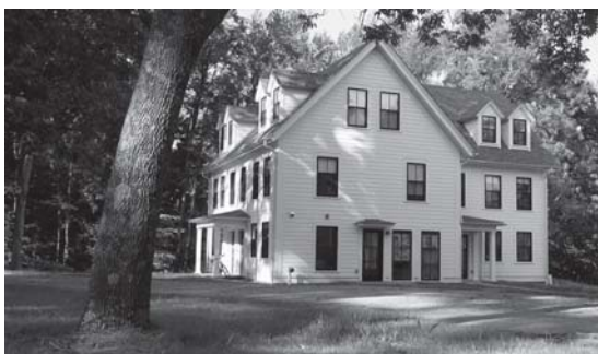
One of the first completed North Campus Housing units.