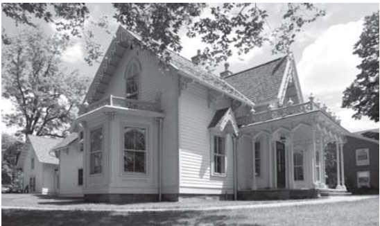
Finn House, home of the Kenyon Review