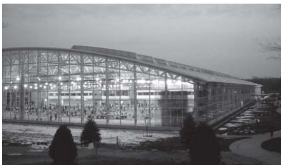
The Kenyon Athletic Center

The project also entailed refurbishing the College's football stadium, McBride Field, and the outdoor track-and-field venue, Wilder Track, which surrounds it. The field now features an all-weather, synthetic-grass surface.