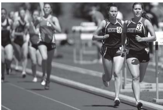
A women's outdoor track meet at Kenyon