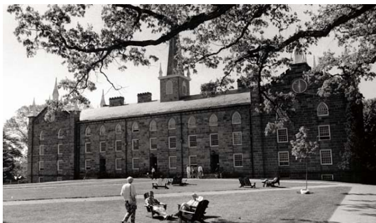
Old Kenyon, the College's first permanent building